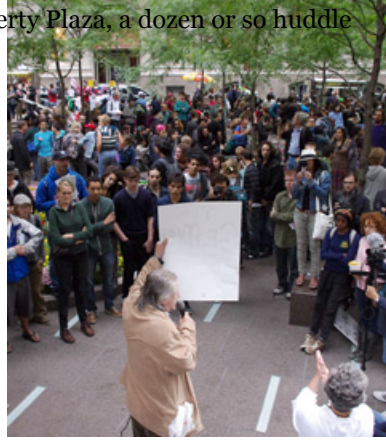
#OccupyWallStreet protesters gathering in New York's financial district on September 17, 2011.

At the center of occupied Liberty Plaza, a dozen or so huddle around computers in the media area, managing a makeshift Internet hotspot, a humming generator and the (theoretically) 24-hour livestream . They can edit and post videos of arrests in no time flat, then bombard Twitter until they're viral. But for those looking to understand even the basic facts about what is actually going on - before September 17 and since - the Internet has been as much a source of confusion as it is anything else.